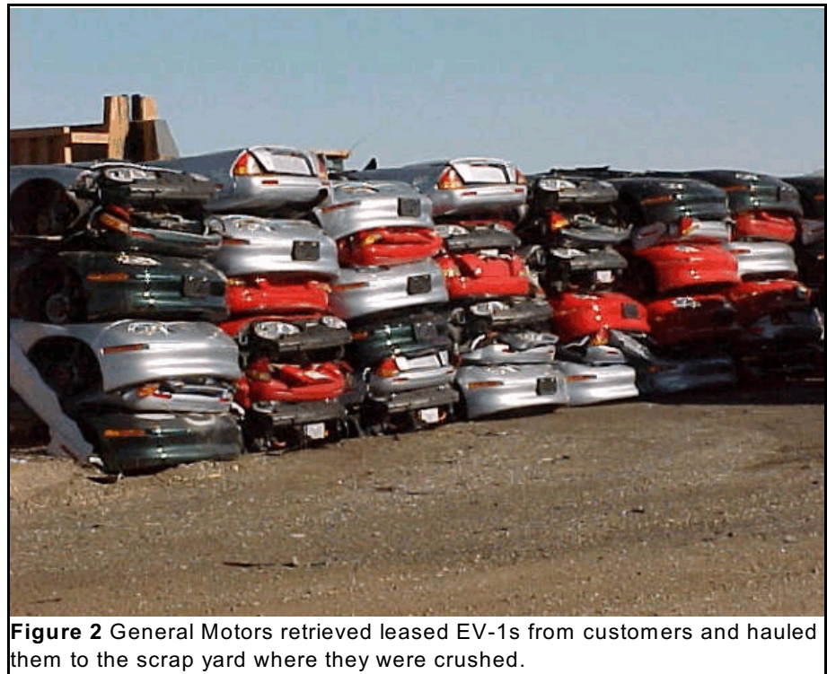
Figure 2 General Motors retrieved leased EV-1s from customers and hauled them to the scrap yard where they were crushed.

Indeed, it is important to get one thing straight: zero-polluting cars that are practical, don't cost a fortune and are incredibly fun to drive because the distance from the accelerator to the wheels is traveled at the speed of light, are unavailable to the public for only one reason: car makers refuse to sell them.