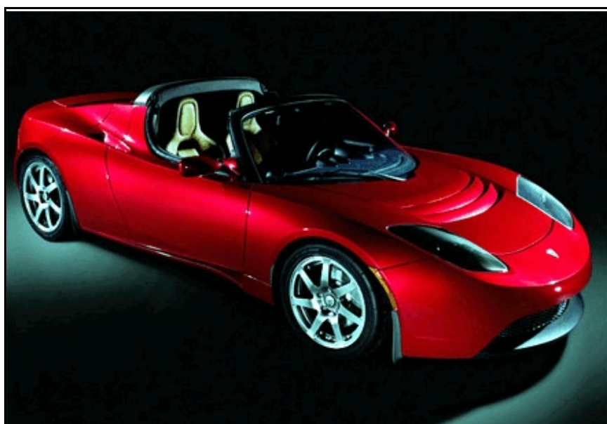
Figure 1 The California-made Tesla: 0 to 60 in 4 seconds, 135 miles per gallon equivalent, priced $4,800 less than a Porsche 911. Best of all: no tailpipe. Charging from fully dead to full takes 3.5 hours, and the battery pack is guaranteed for 100,000 miles or 5 years.

Every car lover's dream: 0 to 60 in 4 seconds, a beautifully sculpted aerodynamic body to die for, 135 miles per gallon equivalent, priced $4,800 less than 1 a Porsche 911. 1 Best of all: no tailpipe. Charging from fully dead to fully full takes 3.5 hours, and the battery pack is guaranteed for 100,000 miles or 5 years. 2