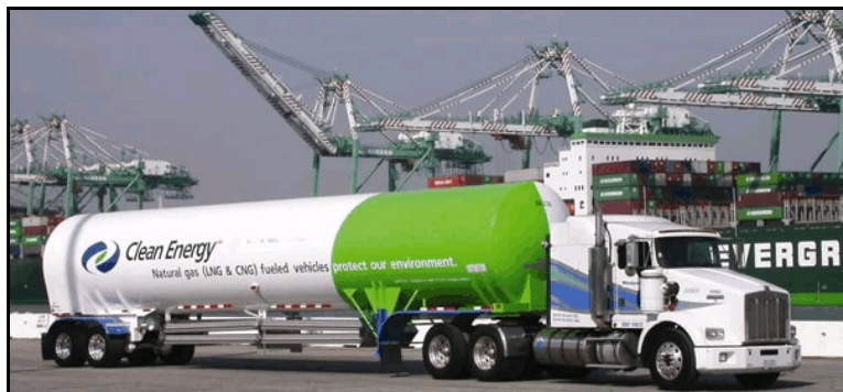
Figure 7 In a collaborative effort between one of the largest U.S. truck makers, Kenworth, and a British Columbia, Canada manufacturer of engines, Westport Innovations, the two have developed a truck fueled by LNG. Versions of it are to be used at the ports of Los Angeles and Long Beach, through which 60 percent of the imports into the U.S. pass.

Another option for trucks—as well as ships and locomotives—is to convert from conventional petroleum based fuels to something else. One option is liquefied natural gas (LNG), widely used in China and other nations with ample supplies of natural gas. Over-the-road 18 wheelers running on natural gas produces a small fraction of the pollution from conventional diesel engines.