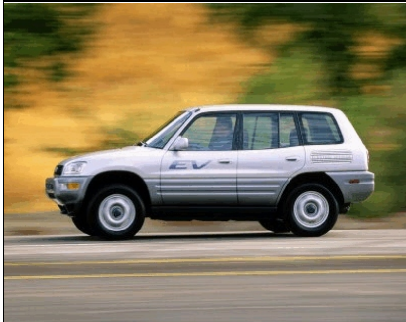
Figure 3 Toyota discontinued production of the battery-powered RAV4 Electric Vehicle in the spring of 2003.

There is no shortage of half-truths and outright falsehoods in discussions of just what can be done to reverse global warming. But the biggest whoppers are about planes, trains, automobiles and other vehicles that travel from point to point with people or cargo in them. All of that could be accomplished with zero or near-zero air pollution but the end result might be the end of not just General Motors, Ford and Chrysler, but Boeing and its aircraft, General Electric and its locomotives and Kenwood and its trucks. (This section focuses principally on vehicles that travel over ground, while another addresses air pollution from ships.)