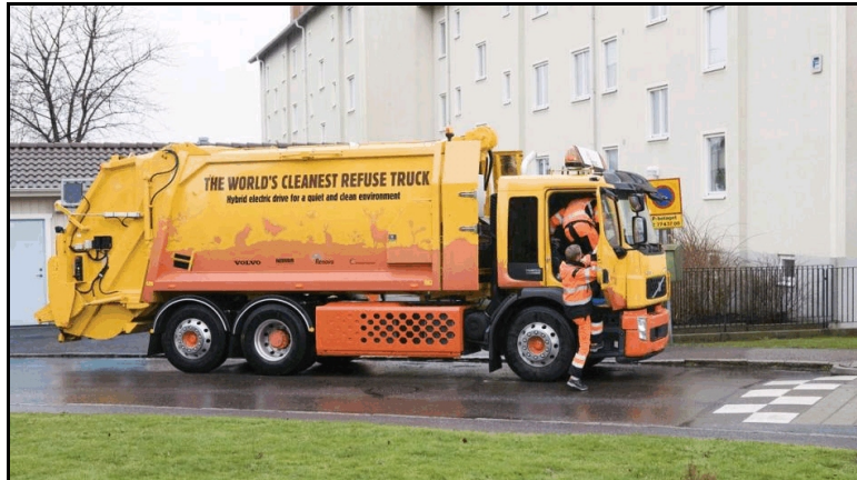
Figure 6 Volvo's version of the hybrid technology couples a diesel engine with an electric motor. Electricity provides the initial push, but not the racket of a diesel-only garbage truck. At about 12 miles per hour, the diesel kicks in, and when the truck stops it automatically switches off. Fuel use and air pollution emissions are expected to be reduced between 20 and 30 percent when the truck is placed in commercial service in 2009.

As hybrid technology becomes more widespread in cars, it has also been making a transition to trucks. Volvo's version of the technology couples a diesel engine with an electric motor. Electricity provides the initial push, but not the racket of a diesel-only garbage truck. At about 12 miles per hour, the diesel kicks in, and when the truck stops it automatically switches off. The batteries are recharged during braking by generating electricity from the truck's forward momentum, an ideal approach for stop-and-go use such as garbage collection. 25 In addition, an extra battery pack, recharged at night, powers the garbage compactor. Altogether, fuel and air pollution emissions are expected to be reduced between 20 and 30 percent when the truck is placed in commercial service in 2009. 26