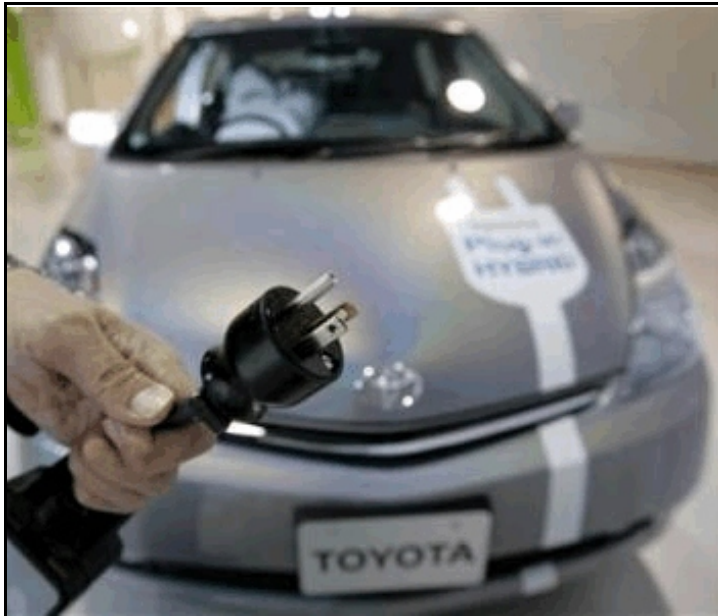
Figure 5 Not content to drive a Prius hybrid that got a mere 50 miles to the gallon, a group of self-described entrepreneurs, engineers, environmentalists and consumers started the California Cars Initiative (CalCars.org), a Palo Alto-based nonprofit organization to convert them to 100 mile per gallon “plug-in” hybrid electric vehicles, “harnessing buyer demand to help commercialize PHEVs,” in their words. They can now recharge the batteries on household current.

Conversions are limited to certain vehicle types. The easiest are for the 2004 to 2008 Prius models (not 2001–2003 Prius) and the Ford Escape/Mercury Mariner Hybrid.