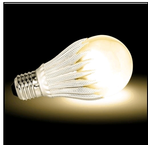
Figure 4 Light bulbs that use light emitting diodes—those tiny lights in the front of a TV or video player—are the wave of the future. They will last for as long as 15 years in normal use, and reduce electricity consumption from, for example, 30 watts to 0.7 watts. (Source: Crane, Inc.)

Every light bulb must be a florescent. (OK, leave some incandescent bulbs in chandeliers and other places