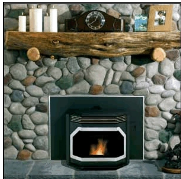
Figure 2 Fireplace inserts like this burn pellets made from sawdust, corn or other biomass, reducing emissions soot, or black carbon, up to 96 percent and tripling, or more, efficiency.

Have a fireplace? Close the damper and fill it with decorations. If a cozy winter fire is essential, fill a can with dollar bills and light them, because that's what a fireplace does: burns up hard earned money. Just as