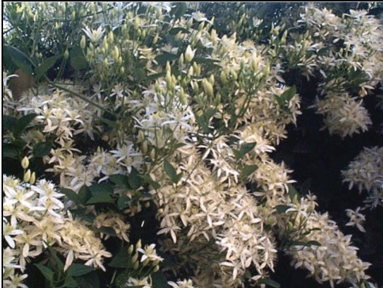
Figure 3 Deciduous vines, such as this clematis, planted along south and west facing walls will provide shade in summer but let light through in winter.

Need to heat with wood for some reason anyway? Install a pellet stove or a fireplace insert.