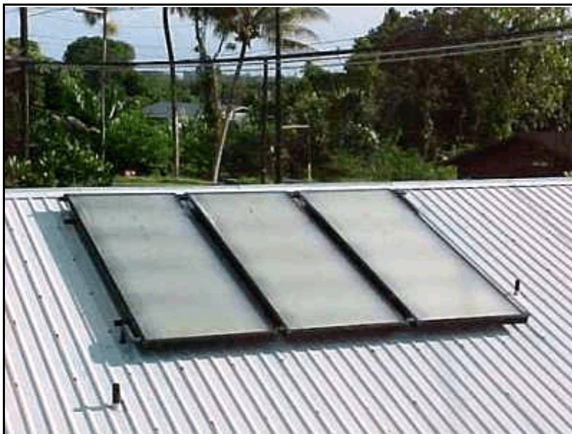
Figure 1 On average, a solar system like this will cut water heating bills by 50 to 80 percent.

The principal reason "climate change" is so widely used is that Republican pollster and political strategist Frank Luntz urged it on the GOP. He wrote in a memorandum that "while global warming has catastrophic communications attached to it, climate change sounds a more controllable and less emotional challenge." 1 Don't allow yourself to be victimized by double-speak.